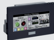
PLCs WITH TOUCH PANEL