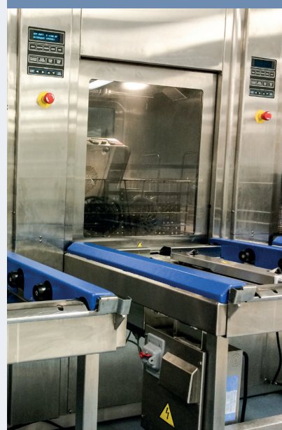
Sterilizer for books, washer for medical, UV sanitizer...